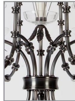
DUQUETTE DARK PEWTER