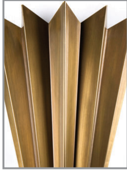
DUQUETTE ANTIQUE BRASS