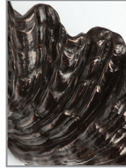
DUQUETTE ANTIQUE BRONZE