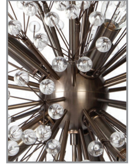
DUQUETTE DARK BRONZE