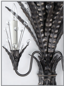
DUQUETTE RUBBED BRONZE